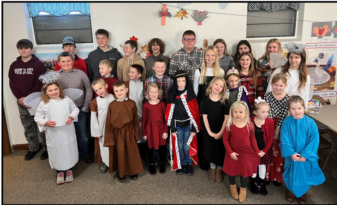
2022 Sunday School Christmas Program