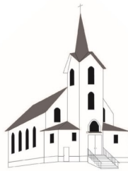
Rolling Forks Lutheran Church 1867-1966