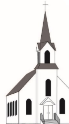
St. Pauli Lutheran Church 1877-1966