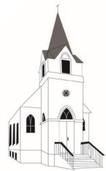
Swift Falls Lutheran Church 1877-1966